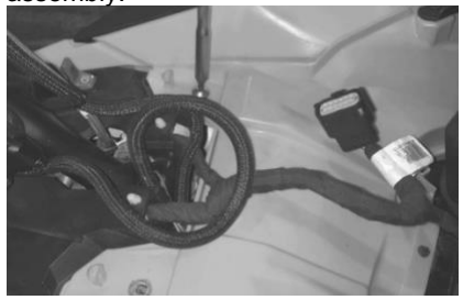
(2) Remove the gauge and unplug it from the wiring harness. Remove the right side panel and hood, unplugging any other harness plugs attached, as well as disconnecting the air box. Follow the wires from the stock kill switch cutting any zip ties holding the wiring harness. Trace the wires to locate the wiring harness plug behind the coolant reservoir and unplug it.