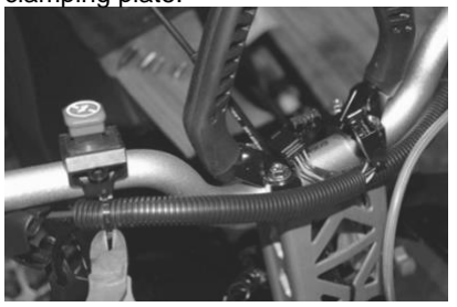
(4) Take off the riser cover to expose the wiring harness plugs.Follow the wires from the thumb heater

(3) Using an Alan key, undo the bolt on the clamping plate of the thumb throttle. Use a flat head screwdriver to push in the small tab while sliding the plastic clamping plate away from your grip. (Some models may have different style throttle block) You may have to take off the kill switch by removing the torx screw before taking off the throttle clamping plate.