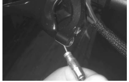
(13) Pull on the cable housing to extend the cable and slide the cable through the slot in the aluminum block. Release the cable housing allowing it to slide into place.