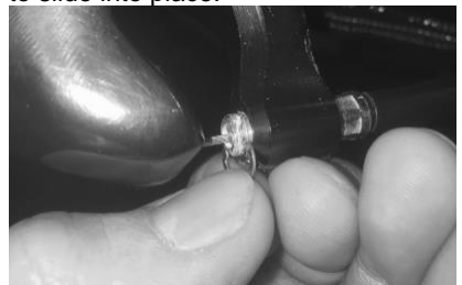
(14) Using the low profile C-clip provided with your finger throttle, install it over the end of the cable housing to secure it in place.