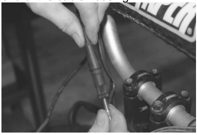
(18) Pull the rubber boot to expose the throttle cable adjuster in front of the handlebars and undo the plastic locking nut with your fingers.