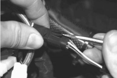
(11) Follow the wires from your thumb heater to the harness plug and disconnect the plug by prying up the locking tab with a screwdriver.