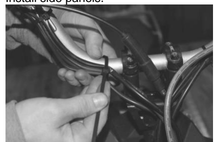
(21) Using zip ties, fasten loose wires to your handlebars.

(20) Cover up the harness plugs with the cloth boot and tuck them back into the machine. Put the hood back on making sure to connect all the harness plugs that were disconnected earlier. Fasten hood bolts and rivets. Install side panels.