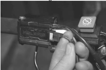
(9) Remove the throttle position switch from the throttle block and remove the throttle block from the handle bar.