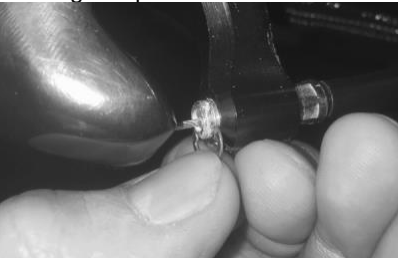
(17) Using the C-clip provided with your finger throttle, install it onto the end of the cable housing.