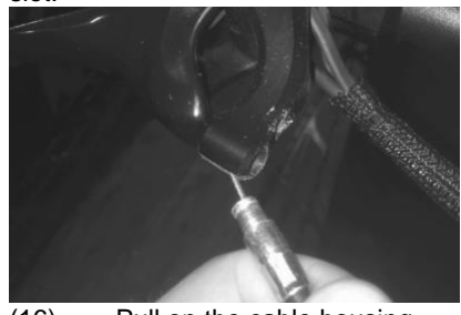
(16) Pull on the cable housing. Slide the cable through the slot in the aluminum block and release the housing into place.