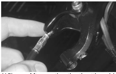
(15) After routing the throttle cable in front of the handlebars, insert the throttle cable end into the finger lever slot.