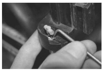
(8) Use a pick tool to remove the C-clip holding the throttle cable housing in. Pull the cable housing out and slide the cable through the slot to detach the housing.