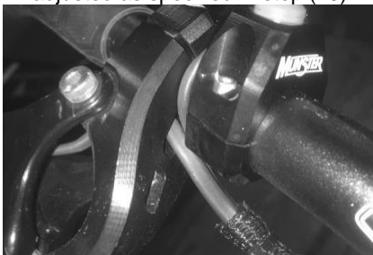
(14) Undo the two clamp bolts on your new finger throttle using an Alan key. Route the wires from the heated grip through the slot in the throttle block. Clamp the finger throttle assembly to the handle bar and snug up the clamp bolts being sure not to pinch the wires.

This connector bypasses your throttle safety switch. If the throttle sticks open unintentionally while the machine is running, the machine will accelerate out of control, even if your finger is released from the throttle lever. A tether should be used at all times while operating the vehicle with a finger throttle. Always check that the throttle is functioning normally before start up and ensure the throttle cable is adjusted as specified in step (19)