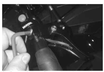
(22) Adjust finger throttle position for rider preference and tighten clamp bolts.