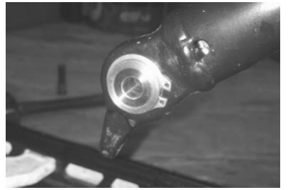
(5) Install the stainless sleeve from your kit into the brass piece, and then reinstall the rear swing arm back into the triangle bracket.