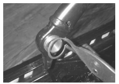
(5) Once the brass is pressed in fully, install the retaining ring included in your kit. If the retaining ring does not seat fully in the groove, the brass is most likely not pressed in fully. Repeat step 4 to get the brass fully seated.

(4) Once the heim joint is removed, install the brass bushing from your delete kit in its place, snap ring groove first. Try to push it in and line it up best you can by hand first. Using a broad flat punch, tap the punch to press the brass in as straight as you can. Be very careful to press the brass in evenly and DO NOT HAMMER DIRECTLY AGAINST THE BRASS. The brass is very soft and will deform if hammered directly against, or with an uneven punch.