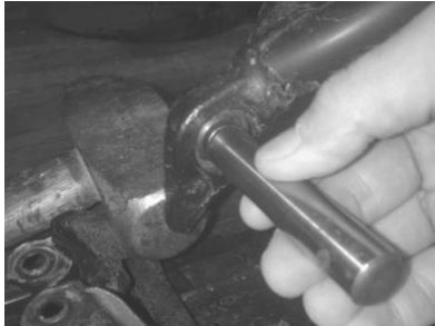
(3) Using a hammer and punch, hammer out the pressed in heim joint. You can get someone to hold a big hammer against the back side of the swing arm to take most of the impact.