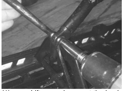
(1) Lift up and support the back of your machine so the track is slightly off the ground. Make sure the machine is stable. Remove the 8mm bolt holding your T-motion heim joint.